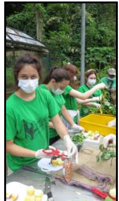
"MSC students working at the Matang Orangutan Sanctuary, 2014. This is one organisation that will receive a donation from the College"