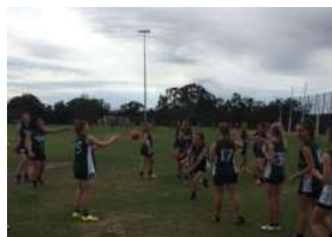
Year 7-9 Girls Football Team